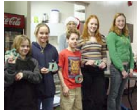
2003 Top Divers in Each Age Group.